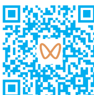
SABIC WeChat Video